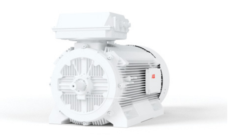
ABB Ability™ Smart Sensor is a condition monitoring solution that makes predictive maintenance possible for low voltage motors. By monitoring and analyzing data on motor operating parameters, motor users can avoid unexpected downtime, optimize efficiency and improve safety.