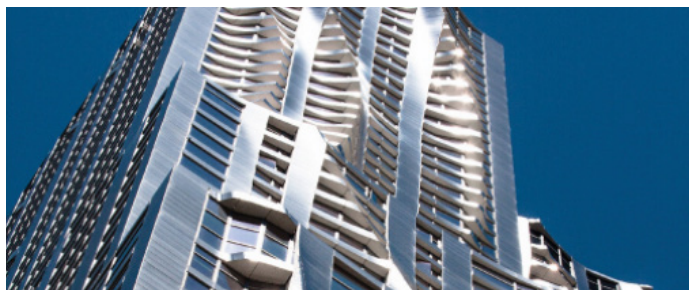
RWDI conducts wind engineering services on some of the world's most notable structures, including New York by Gehry (8 Spruce Street) in lower Manhattan.

RWDI is a multidisciplinary engineering consulting firm specializing in the built and natural environments. They perform a wide range of engineering studies in domains including air quality, climate analytics, energy and water modeling, meteorology, structural dynamics, ventilation, and wind engineering services on some of the world's most notable structures such as the London Millennium Bridge, the Petronas Towers in Malaysia, the Freedom Tower on the World Trade Center site, the second span of the Tacoma Narrows Bridge, the Taipei 101 tower, and the mega-skyscraper, Burj Khalifa, currently the world's tallest building. RWDI is diversified geographically as well, with global operations spanning China, Australia, the Middle East, Europe, the United States, and their corporate headquarters in Canada.