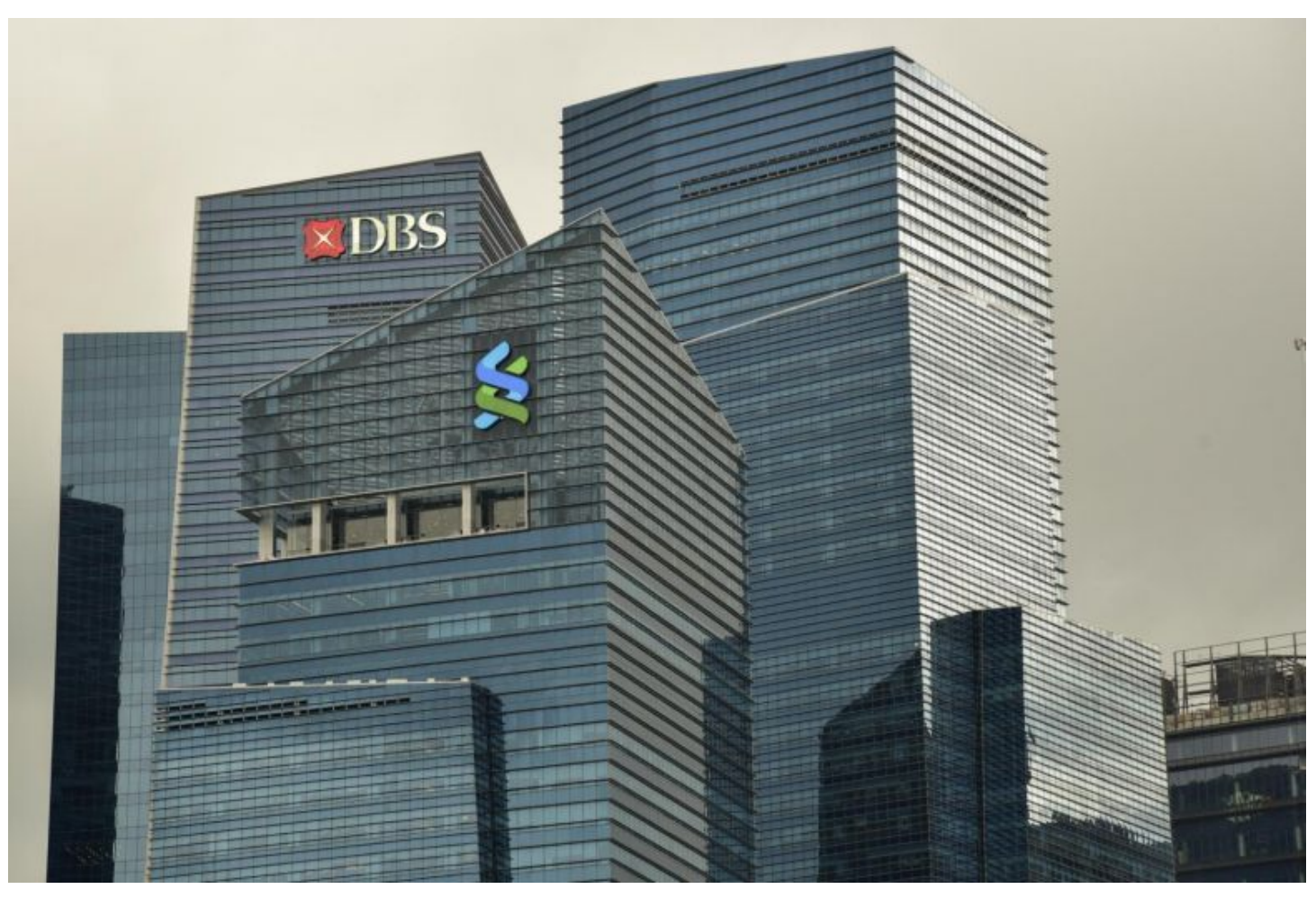
DBS and Standard Chartered created the proof of concept for a digital Trade Finance Registry within three months.