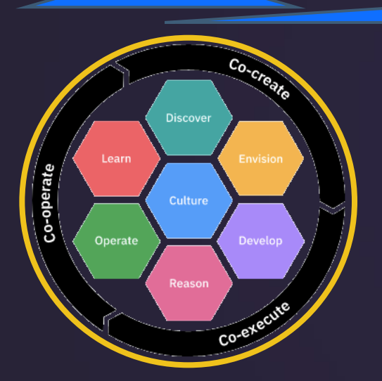
IBM Garage Methodology