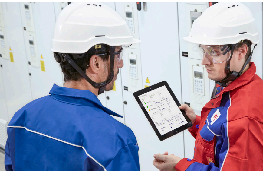
ABB Ability™ Condition Monitoring for drives is a service that delivers you accurate, real-time information about drive events to ensure your equipment is available, reliable and maintainable. The data can be stored in the cloud or in your local storage solution. When you have the facts, you can make the right decisions.

Always one step ahead – reveal your drive's true potential