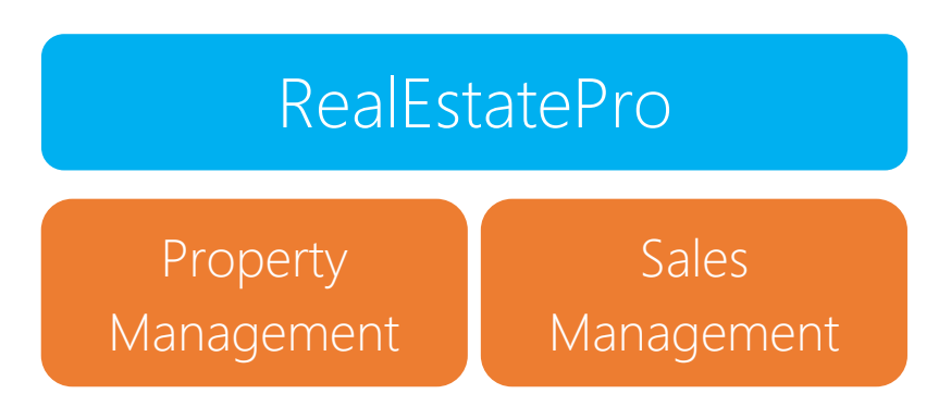
Fig 1: RealEstatePro Architecture

The solution helps manage residential, commercial, and industrial properties, and provide other real estate related services. RealEstatePro provides real time insights on the business that helps the management make strategies and decisions.