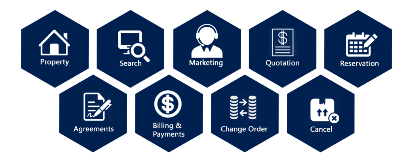
Fig 4: Overall Features of RealEstatePro – Sales Management System