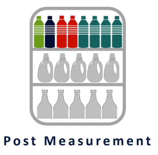
WITHOUT NEEDING EXPENSIVE SHELF AUDITS, WITH LIMITED STORE AND CATEGORY DEPTH