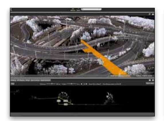
Analyze mapping data and create reports.