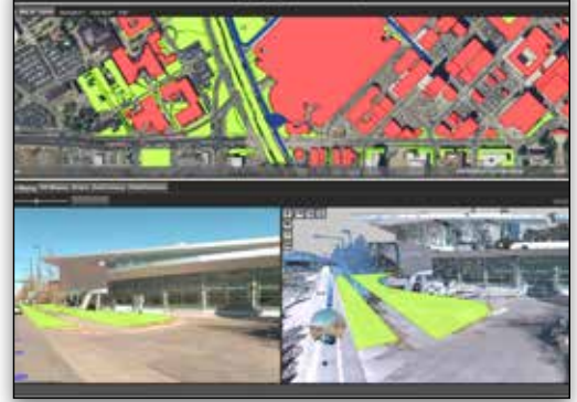
Navigate mapping data in full 2D or 3D view.