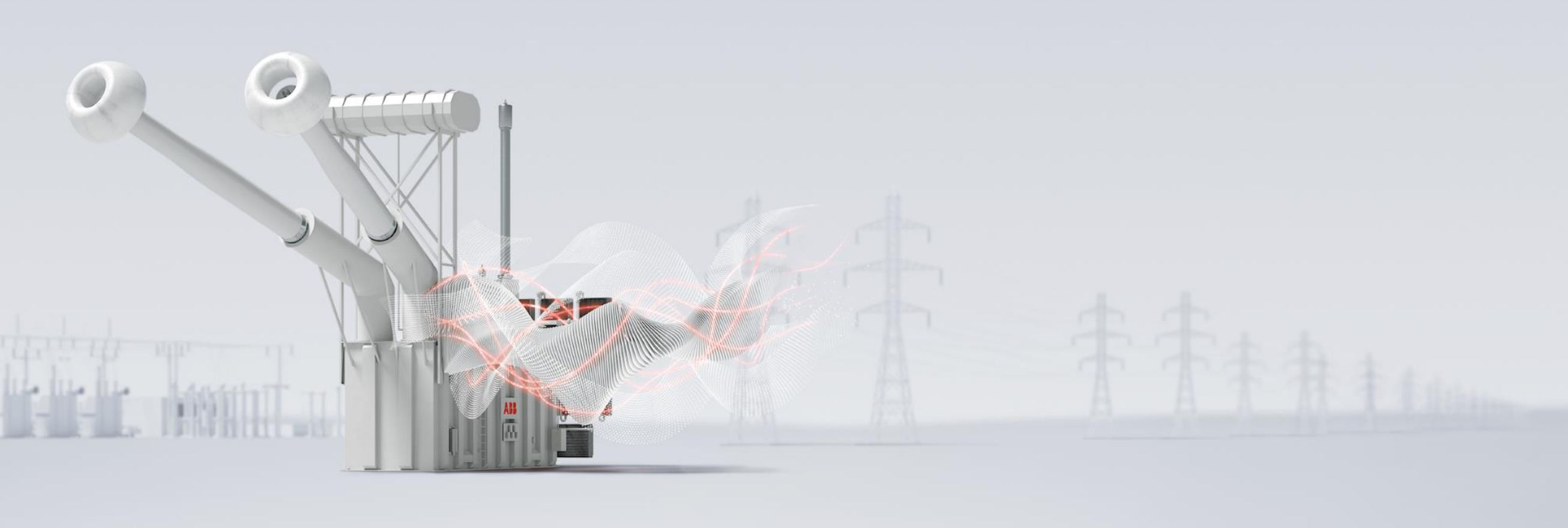
ABB Ability Energy Management for Sites