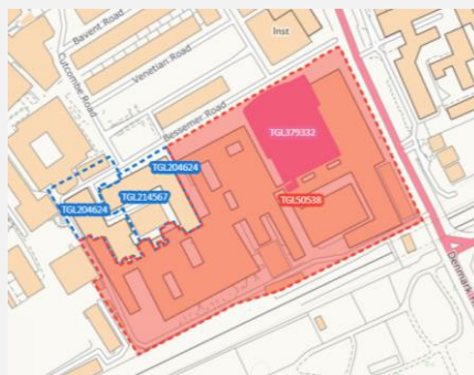
Create a clear site plan.