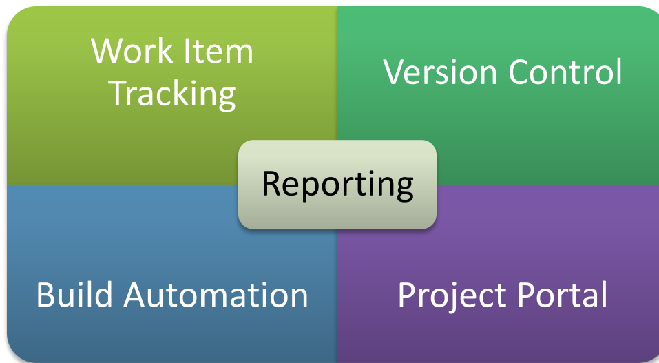
Team Foundation Architecture