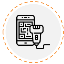
RFID Readers & Antennae