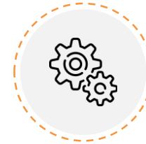
Enterprise Systems Integration