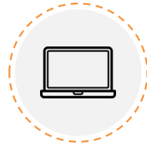
Asset Location Tracking Dashboard