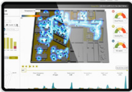
Insights to increase space utilisation