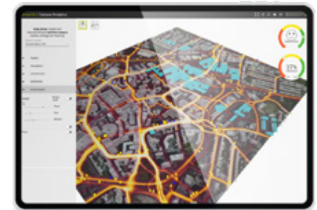
Single source of truth