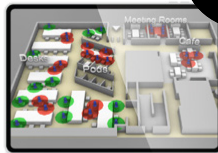
Implement post-Covid-19 / social distancing solutions