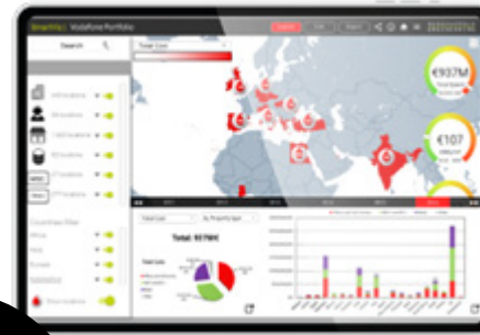
Save cost across portfolios