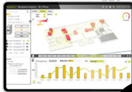
Reduce energy consumption