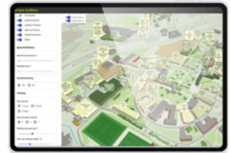
Visualise each campus, building, floor and room