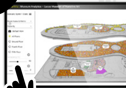
Test 'what if' scenarios