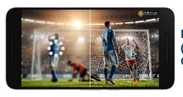
Fovea Stream (mobile) value for OTT players