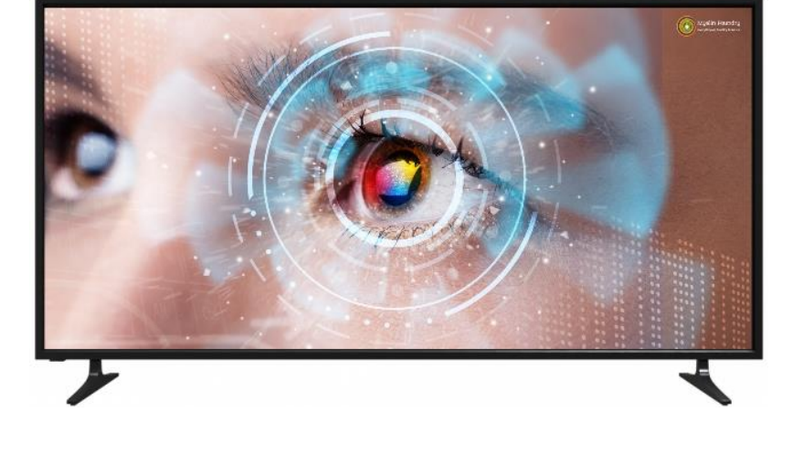
Fovea Stream for mobile

Disrupt streaming costs for zero-rebuffering HD streaming in unstable bandwidths and enable scale