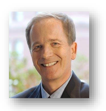
Microsoft in Health