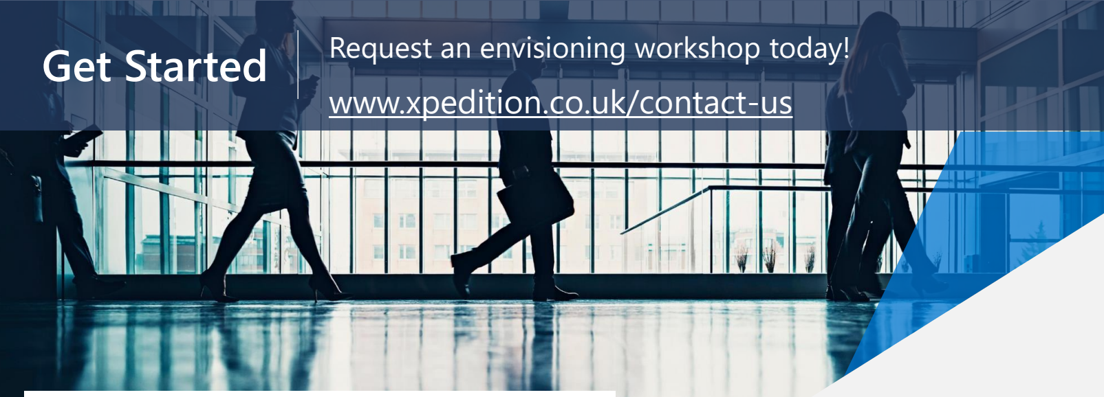
Subject to Xpedition Limited standard Terms and Conditions

Built on Microsoft Dynamics 365 and the Power Platform, the Xpedition Wealth Management Accelerator empowers users thanks to unique features that deliver business growth and a modern, digital client experience. By leveraging a holistic, 360-degree view of critical client and investment data, firms can maximise client value through the use of intelligent business applications. Key features include relationship intelligence, pipeline management, KYC and onboarding, regulatory compliance and audit trail functionality, and digital marketing & communications management.