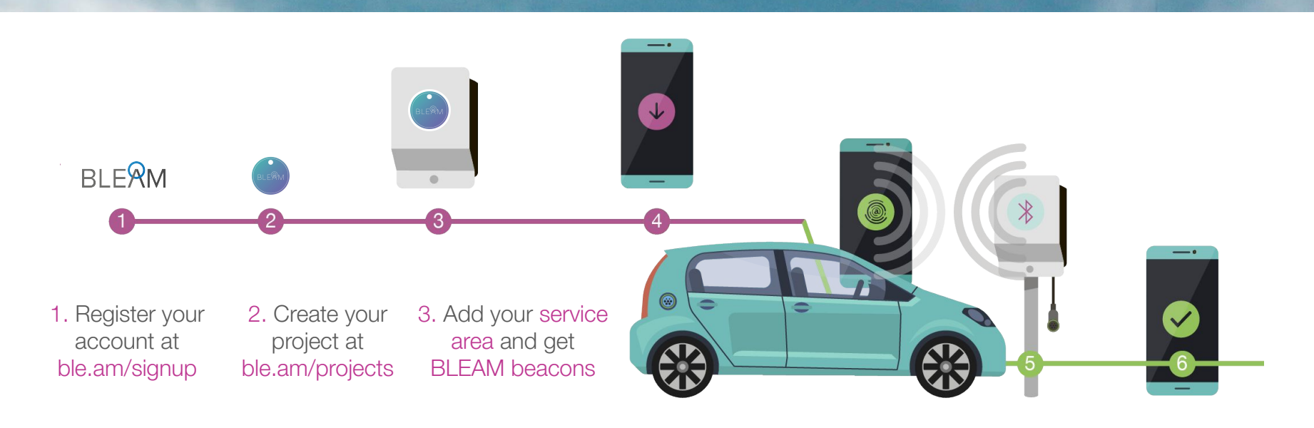
4. Integrate BLEAM Mobile SDK to your iOS/Android apps