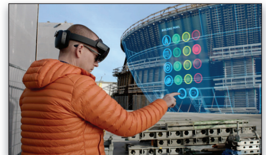
SYNCHRO Pro is part of the SYNCHRO's digital construction environment, which also includes mixed reality and mobile applications, and a portal for managing multiple projects with cloud services.