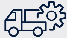
LOGISTICS & TRANSPORTATION