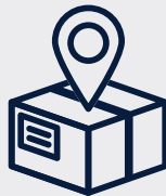
CPG & DISTRIBUTION