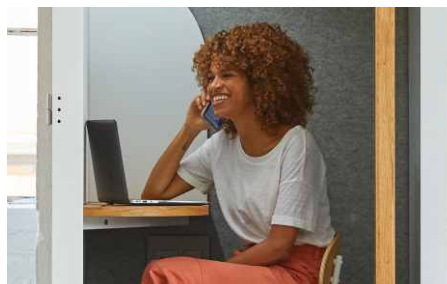
Customer Relationship Management