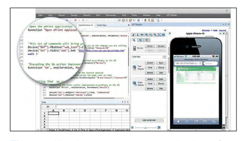
Figure 2. Use the same automation technology of UFT for real mobile device testing.

As a key component of Micro Focus Mobile Center, UFT allows real device testing on multiple operating systems. It enables your mobile testing teams to both automate and accelerate testing, reusing testing scripts on multiple real devices. The solution is built to support frequent-intensive regression and functional testing, and it supports both Agile and continuous development processes.