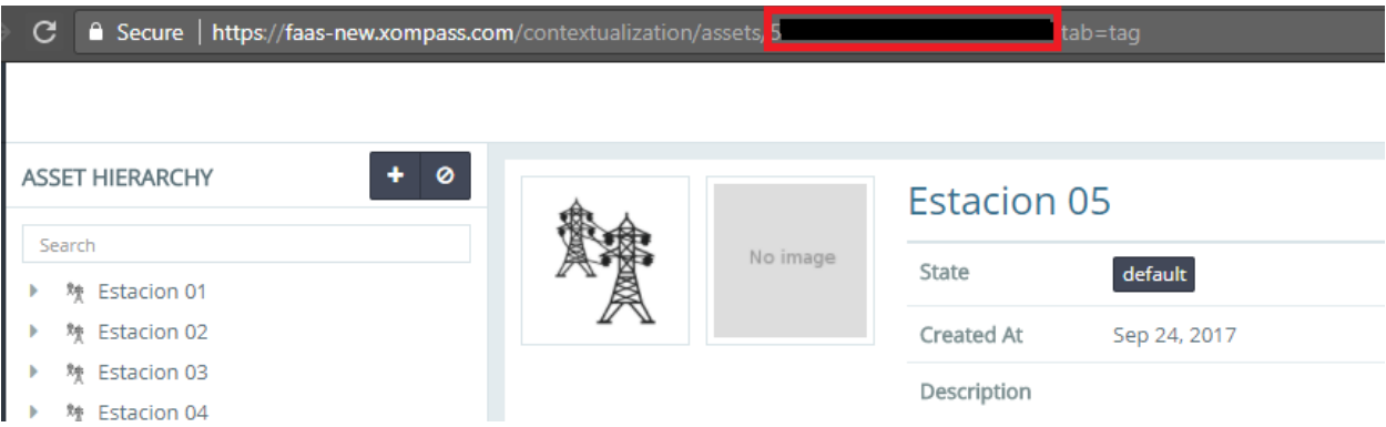
Figure 7: Asset ID on the Asset URL in Asset Contextualization section.