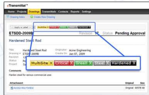
Helpful labels applied to a drawing