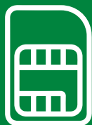
TeleWare SIM SIM BASED RECORDING

Find out how TeleWare's Mobile Voice and SMS Recording portfolio can help increase business productivity, support training, improve governance and meet regulatory requirements.