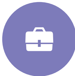
Distribution & Wholesale