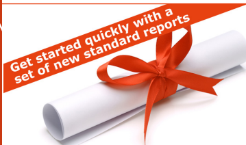
ForNAV Standard Reports