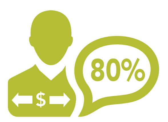
More than 80% of panelists expect their banker to understand how money moves through their business.

I had a bank that did not understand our business and was very difficult to work with. I switched to another bank and was impressed that in a very short time they knew way more than the old bank about our business. Because they understand the nature of our business and customers, they are a joy to work with.