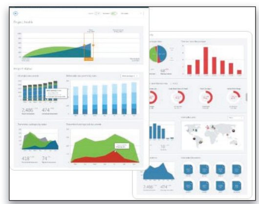
Increase project transparency and zero in on potential bottlenecks.

ProjectWise Connection Services provide remote users and field workers with onsite views into multiple-project data. Using ProjectWise WorkSite and ProjectWise Explorer, you get personalized views that ensure real-time decisions are made using the most relevant and current information. This also eliminates the risk of relying on potentially outdated printed materials. You have direct, secure access to multiple- project repositories, required electronic documents for inspection, and the ability to collect real-time data from the field.