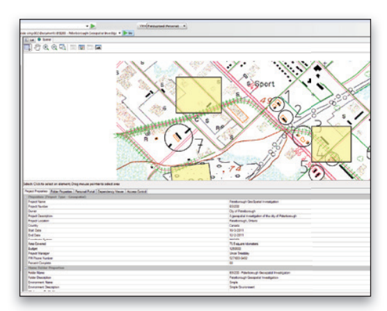
Easily navigate project data by spatial location to retrieve all required content.

Automate your specification tasks to evolve specs from simple text into dynamic engineering documents. You can update specifications at the source when information changes for ultimate control over versioning. Then publish custom versions based on trade, phase, or geography to streamline workflow. progress against milestones, alert reviewers, and deliver actionable data in context.