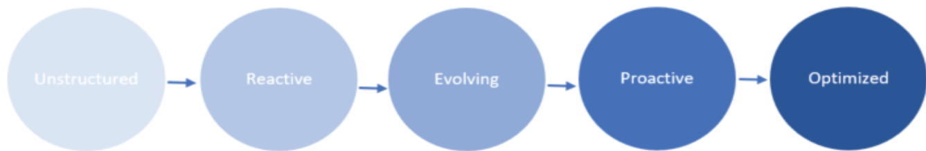
The Evolution of Compliance from Expense to Asset

Activity: The activity is the actual job function that needs to be performed. An activity can be as detailed or generic as the administrator sets it to be, and it can easily be customized to your organization's needs. Templates are available to simplify your organization's goals into worxsmart activities for a quick large-scale deployment.