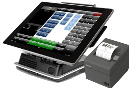
Invoice is printed at POS and attached to the package