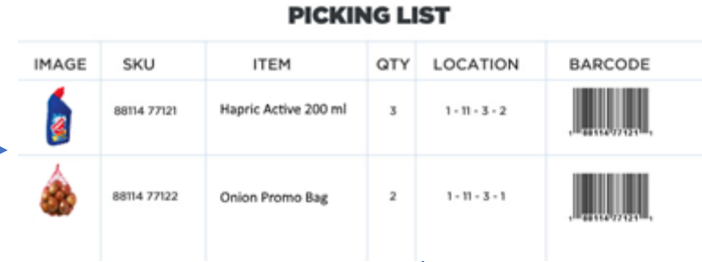
Picking list is generated at the appropriate store

Light customization may be required for multiple w/h locations