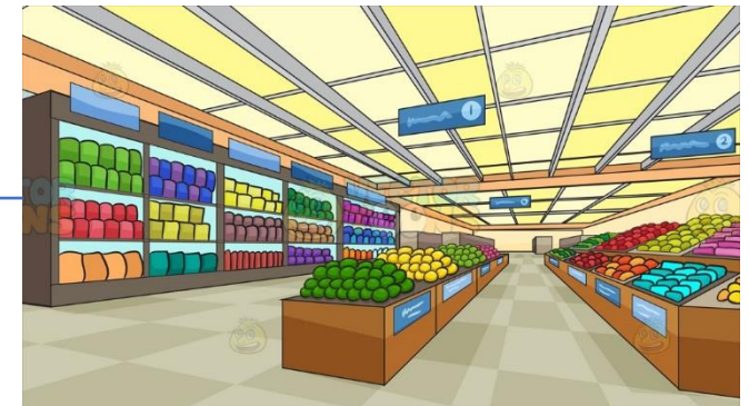
Order is picked by the store-worker