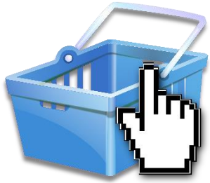
Customer places order on the website