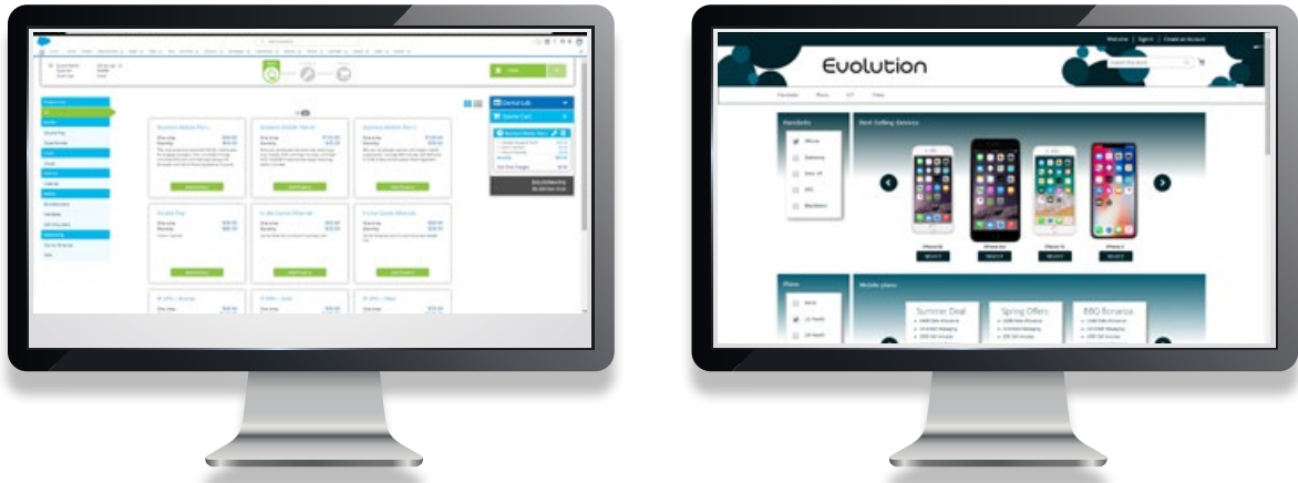
Sigma CPQ within Salesforces and Supporting E-Commerce Deployment