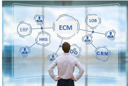
Simplify the complex with QFlow

Providing simple Solutions to complex problems and an unmatched level of Customer Support"