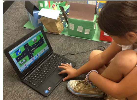
Val Verde Unified School District Elementary Students use Drawp for School to design urban, suburban and rural communities for STEAM learning.