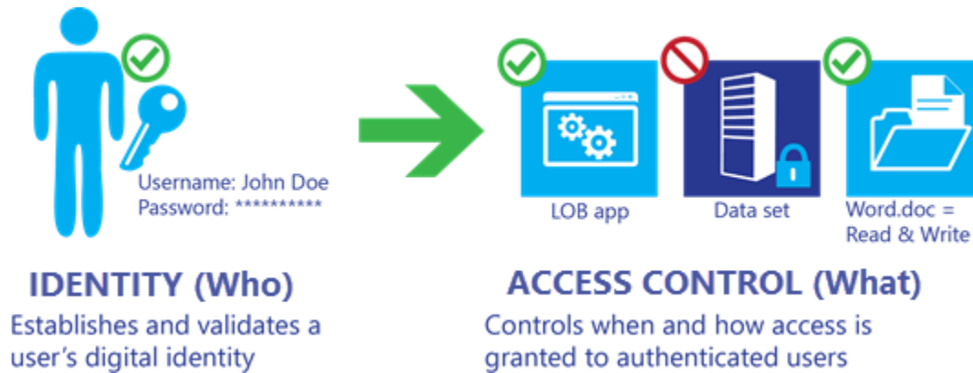
Figure 2: Who does what

User or identity management is one of the core services that organizations work to provide in a seamless fashion, and in ways that are simple to use and easy to manage. Identity & access management provides users the ability to access and use resources in their environment; it is the glue between the 'who' and the 'what' shown in Figure 2.